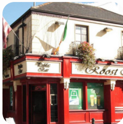
Roost Lively bar and restaurant