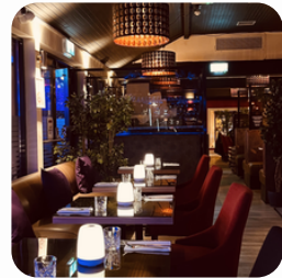
Red Torch Ginger Thai and Southeast Asian