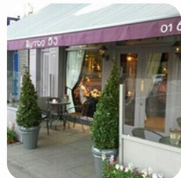
Bistro 53 Mediterranean