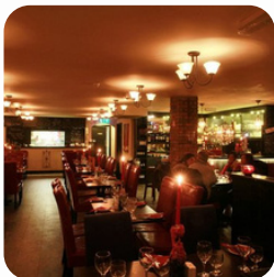
Picaderos Argentine, Spanish tapas