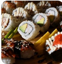
The Orient Japanese Restaurant