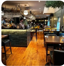
Avenue Café Restaurant & Bar