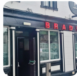
Bradys (Clockhouse) Pub