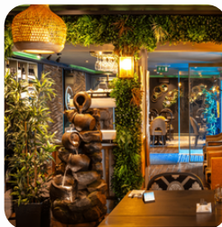
Delhi Darbar Indian cuisine