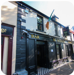
McMahon's Bar & Lounge Pub

Try some traditional Irish pub grub or the iconic spice bag in one of the numerous restaurants you can find on Maynooth Mainstreet.