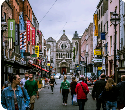
Dublin City Centre

Ireland is known for its friendliness and recently Ireland ranked as the 2nd most peaceful country in the world (2025 Global Peace Index). It also boasts a lively, young, vibrant culture ( discoverireland.ie ) with its traditional music and atmospheric pubs across the country.