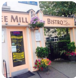
Coffee Mil Bistro Café and traditional Irish lunch