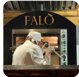
Falò Italian Restaurant