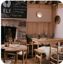
ELY Wine Store Wine bar and café

Try some traditional Irish pub grub or the iconic spice bag in one of the numerous restaurants you can find on Maynooth Mainstreet.